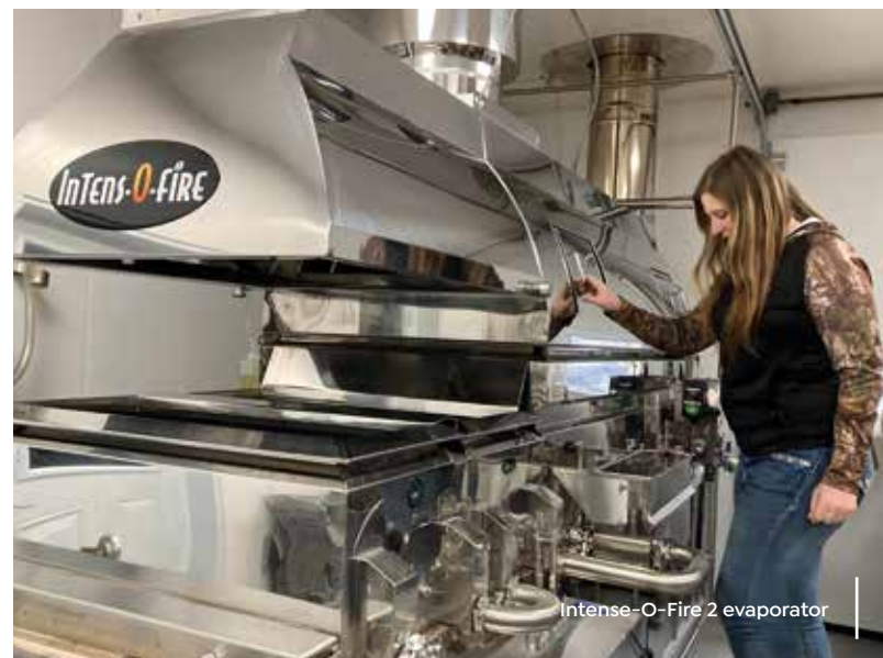
Intense-O-Fire 2 evaporator

“When I first bought my farm, I had 75 acres and 10 sheep. The sugar bush had 200 taps and a small evaporator, but I quickly decided I wanted more taps. So, with a good friend who lives down the road, we set off into the woods after Googling instructions on how to tap. We added 200 taps, but it turns out the evaporator was way too small! We had to boil day and night for 3 weeks to get through all our sap! It's a good thing I had help when I started! I had neighbours give me hay for my animals to welcome me to the area, and other neighbours—dairy farmers—were always there to lend a hand, like when I was