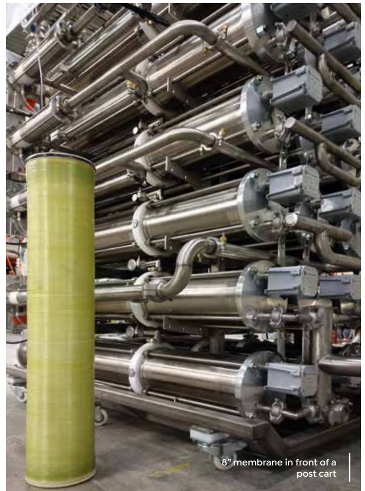
8" membrane in front of a post cart

Keep an eye on your RO all season long. If you notice any unusual noises or abnormalities, don't wait until the next season to check it! Proactive maintenance and repair are crucial to keeping your production running smoothly.