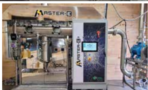
CDL Technology Center now 100% automated