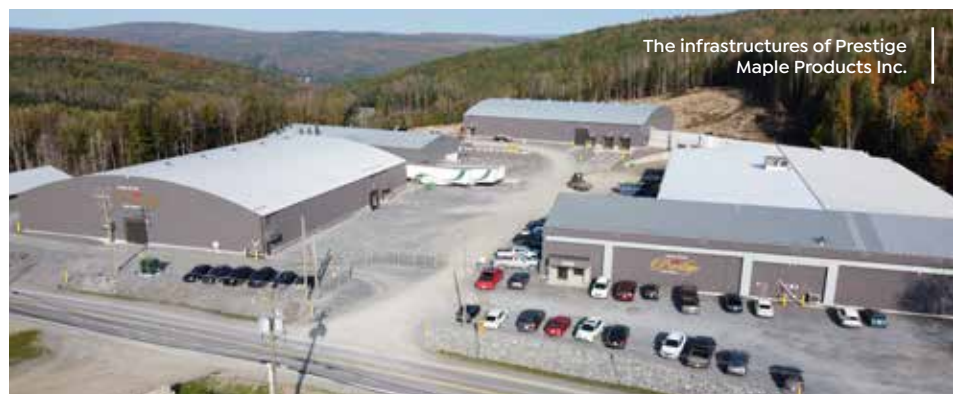
The infrastructures of Prestige Maple Products Inc.

Founded in 1995 by the Lavoie family, the company began with the acquisition of a 2,000 taps maple grove in Témiscouata, Quebec. In 1998, the family created Sirop de l'Est for the distribution and export of bulk maple products. In 2014, new infrastructure was put in place to enhance production capacity. In January 2017, the Prestige Maple Products Inc. division was created for the production and distribution of processed and packaged maple products.