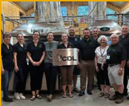
WHEELERS PANCAKE HOUSE Lanark Highlands, Ontario 40 000 taps R7 steam evaporator and SIROCCO pellets evaporator