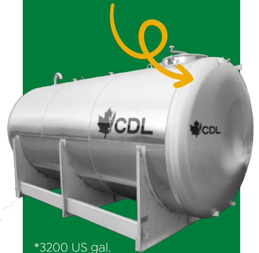
*3200 US gal. model illustrated