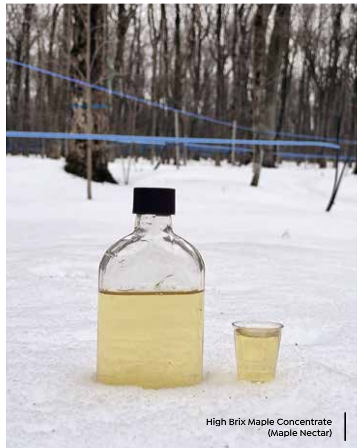
High Brix Maple Concentrate (Maple Nectar)