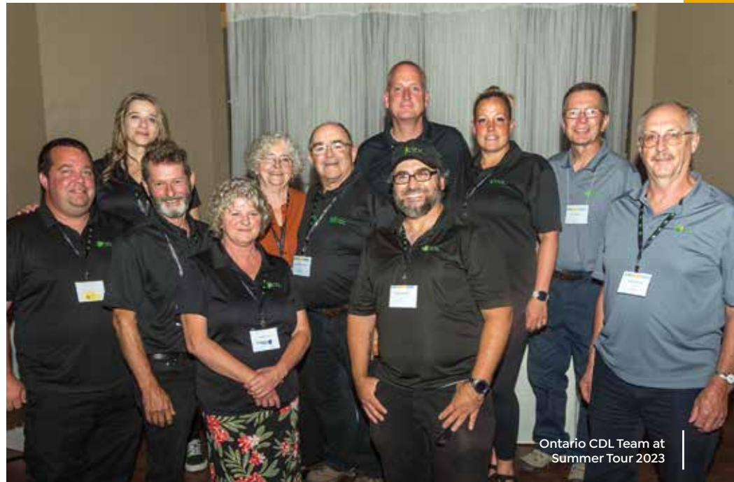
Ontario CDL Team at Summer Tour 2023