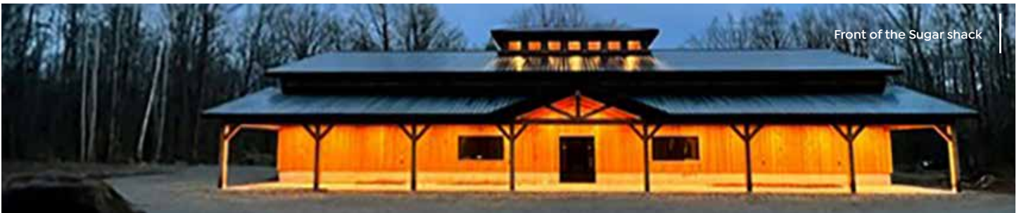
Front of the Sugar shack

Arriving at Backwoods Maple Syrup gives the impression of approaching a traditional sugarhouse. The lines of tubing wind through the forest, steam rises from the stacks, and a large "OPEN" flag greets visitors at the entrance. Upon stepping inside, the initial reaction is one of amazement. The sight of the shiny evaporator and the inviting seating area overlooking it immediately captivates. The air is filled with the delightful aroma of maple syrup, adding to enchanting atmosphere. Interview with Paul Partridge, co-owner